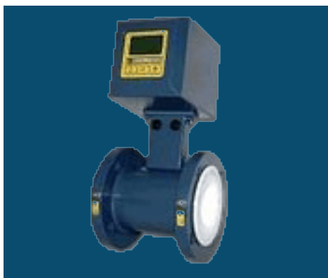
Online flow meters monitor the movement of fuel between points.

An important part of a SNCFuel is the analysis and reporting software. SNCFuel provides sophisticated reporting that highlight problems and give customers valuable management information and alerts.