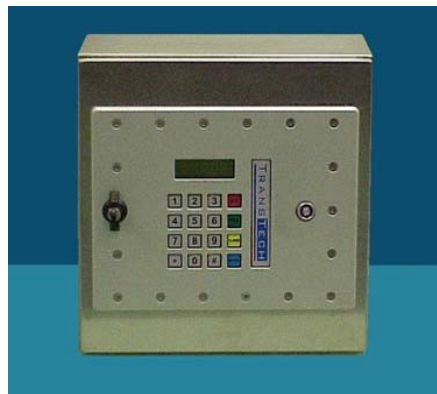
Controllers at every dispensing station—fixed and mobile.